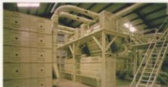
First Stage Cleaning Inclined Cleaners over Stick Machines