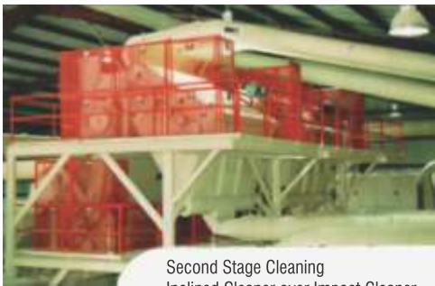
Second Stage Cleaning Inclined Cleaner over Impact Cleaner

Versatile, Efficient, Rugged - Quality Engineered. Continental Eagle's Inclined Cleaner is designed to meet your ginning requirements.