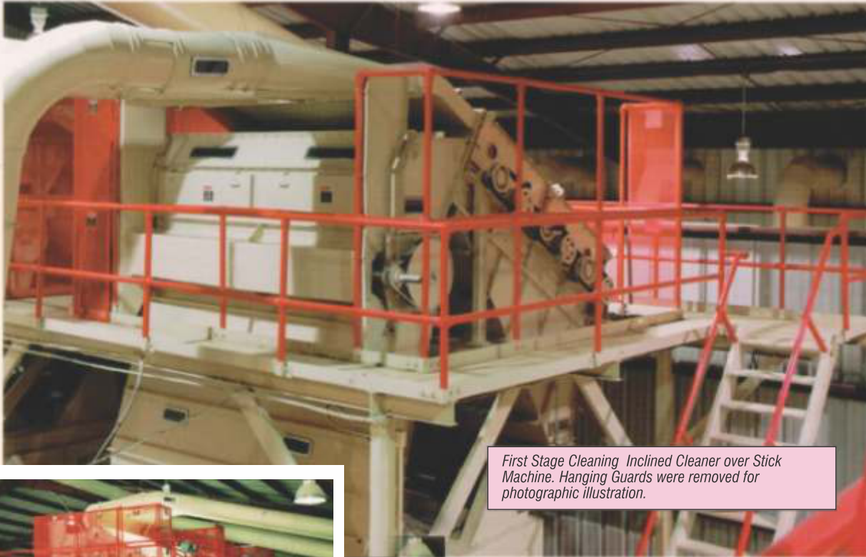
First Stage Cleaning Inclined Cleaner over Stick Machine. Hanging Guards were removed for photographic illustration.