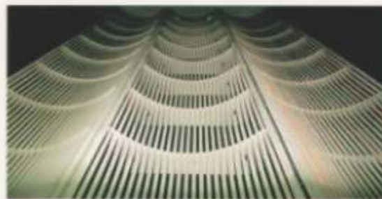
Grid Bar Section