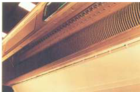
Front View of Serrated Discs