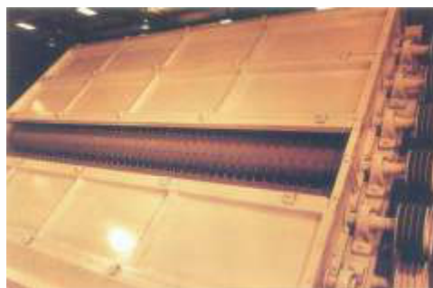
Rear View of Spike Cylinders