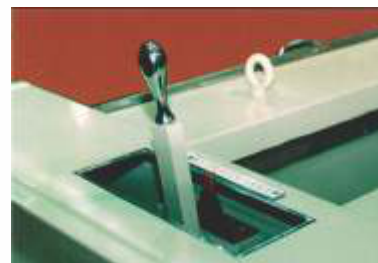
Variable set mote opening control

The amount of trash removed is controlled by the size of the adjustable mote opening. This opening can be adjusted during operation by a handwheel on the exterior of the machine. An external graduated scale having numbers 0 through 10 provides an adjustment reference point. Ejection of trash can be observed through a window on each end or through the door on the front. In the event of a tag forming in the constricting duct, a lever is provided on top of the cleaner to quickly move the mote opening to the full open position.