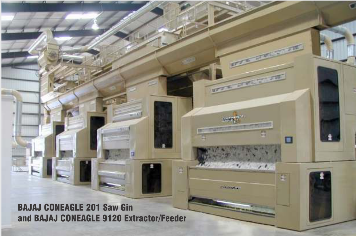
BAJAJ CONEAGLE 201 Saw Gin and BAJAJ CONEAGLE 9120 Extractor/Feeder