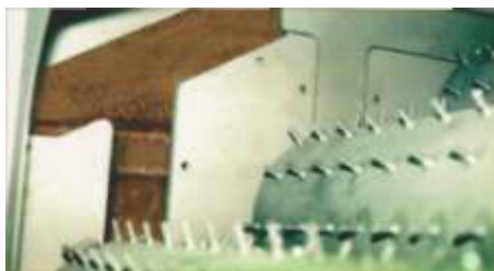
Segmented heads allow each cylinder to be removed with out the complete dismantlement of the feeder.

Other features include 5 1/2" glass windows in the heads to aid adjusting brushes, grids, control bars and doffers. Two full width rectangular windows on front of the feeder allow viewing the flow of seed cotton.