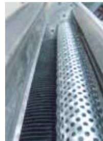
Seed Roll Tube & Conveyor