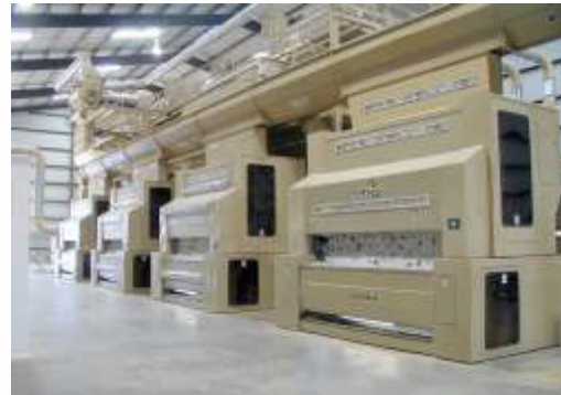
BAJAJ CONEAGLE EagleMax 201 Gin Stand and BAJAJ CONEAGLE 9120 Feeder