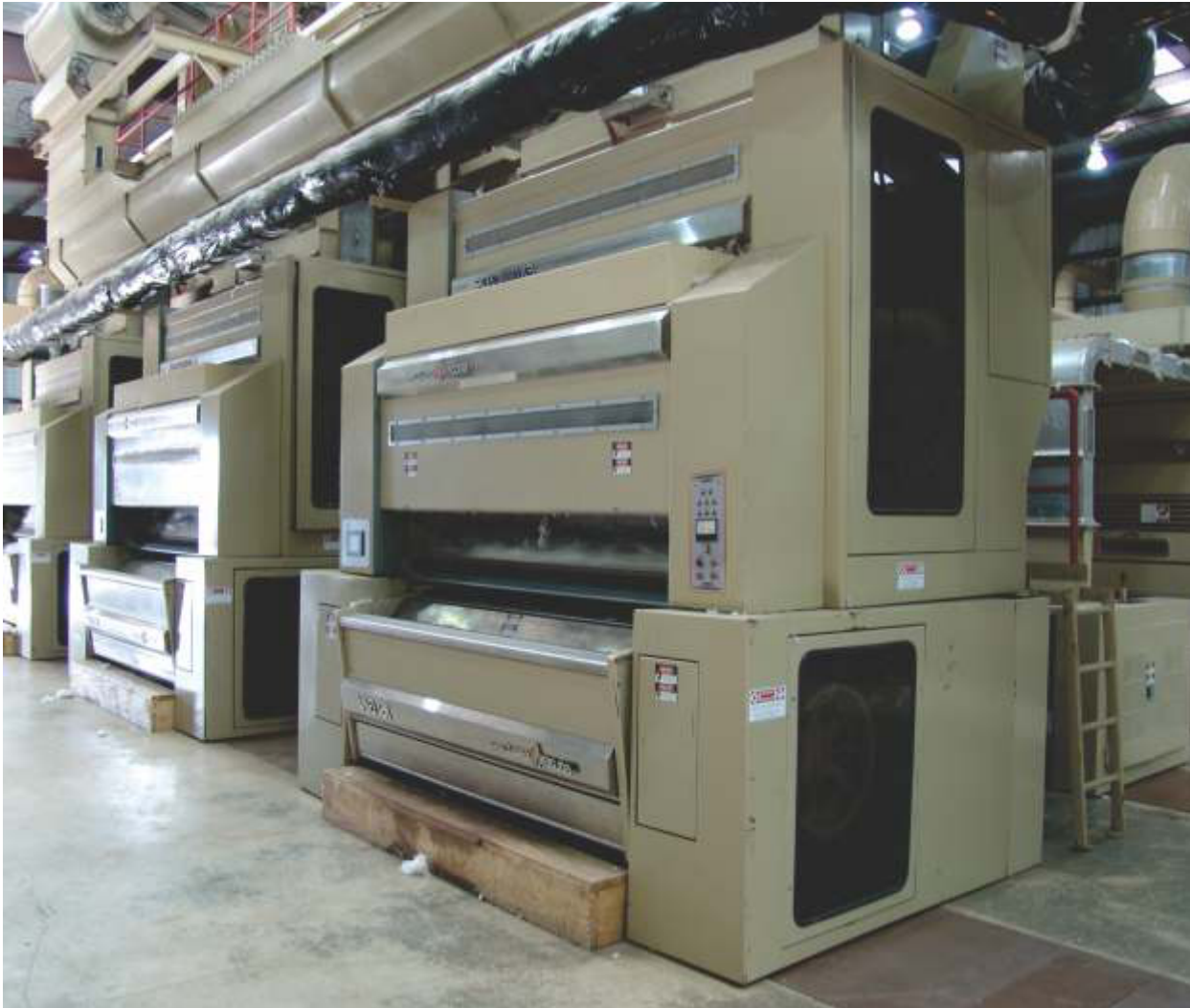
BAJAJ CONEAGLE Golden Eagle Feeder and BAJAJ CONEAGLE 161 Saw Gin