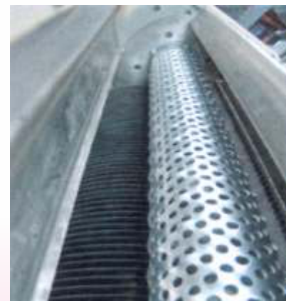
SEED ROLL CONVEYOR TUBE Seed is efficiently removed from the center of the seed roll.